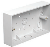
2 gang accessory box with KO 3 x MMT2 & 3 X CR6/CR2