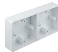
2 x 1 gang accessory box with KO 2 x MMT2