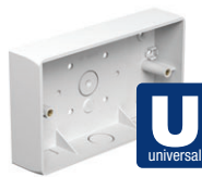
2 gang accessory box with KO 3 x MMT2 & 3 x CR6/CR2