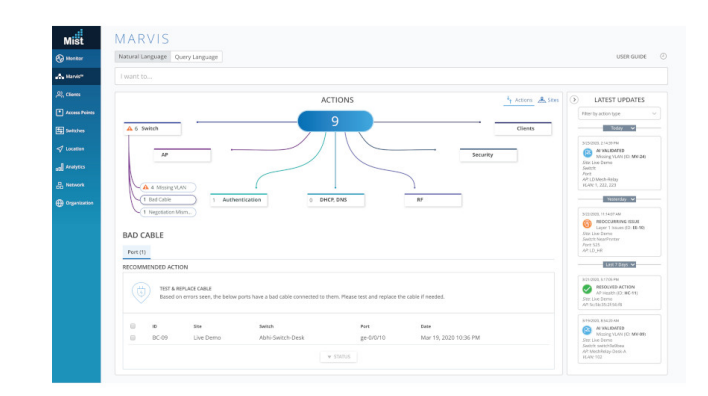
Figure 3: Marvis Actions for wired switches

The addition of Marvis, a complementary Virtual Network Assistant driven by Mist AI, lets you start building a self-driving network that simplifies network operations and streamlines troubleshooting via automatic fixes for <u>EX Series switches</u> or recommended actions for external systems.