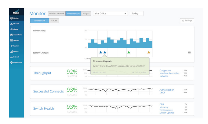
Figure 2: Juniper Mist Wired Assurance service-level expectations screen