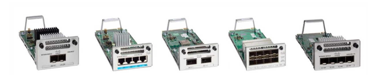
Figure 3. Cisco Catalyst 9300 Series Network Modules