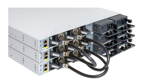
Figure 5. Cisco Catalyst 9300 Series modular uplink models stack (C9300/C9300X SKUs) and fixed uplink models stack (C9300L SKUs)

Table 5 lists the supported stacking options.