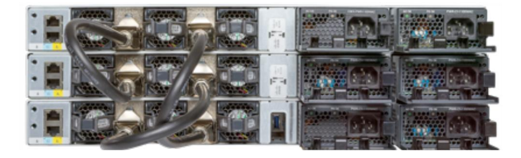
Figure 6. Cisco Catalyst 9300 Series fixed uplink models with optional stack kit