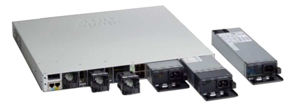
Figure 4. Cisco Catalyst 9300 Series Dual Redundant power supplies

Cisco Catalyst 9300 Series switches support dual redundant power supplies. The switches ship with one power supply by default, and the second power supply can be purchased when the switch is ordered or at a later time. If only one power supply is installed, it should always be in power supply bay #1. The switches also ship with three field-replaceable fans. Power Supplies are common across the Catalyst 9300 Series.